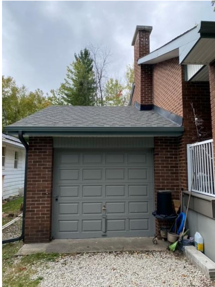
Site Photo 1 – Existing Attached Garage